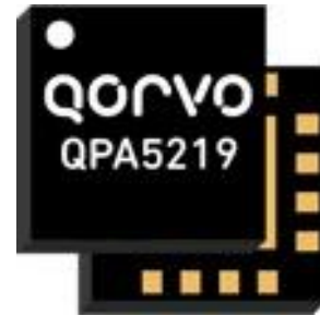
16 Pin 3x3 mm Laminate Package

The QPA5219 integrates a 2.4 GHz power amplifier (PA), regulator and a power detector for improved accuracy.