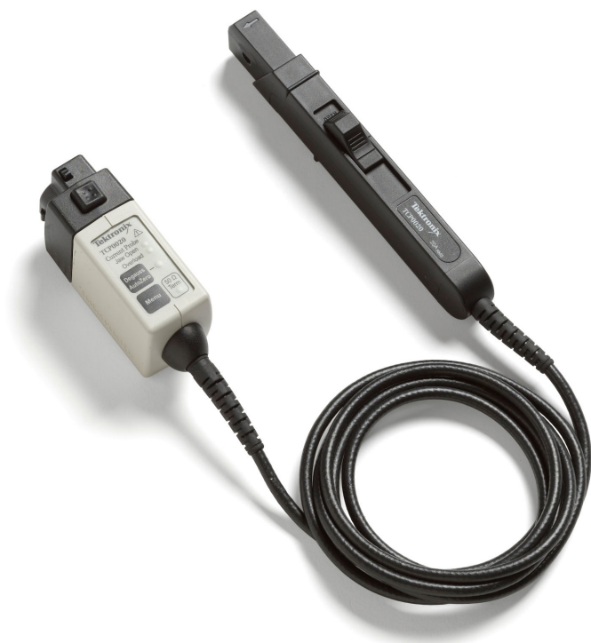
TCP0020 AC/DC Current Probe.