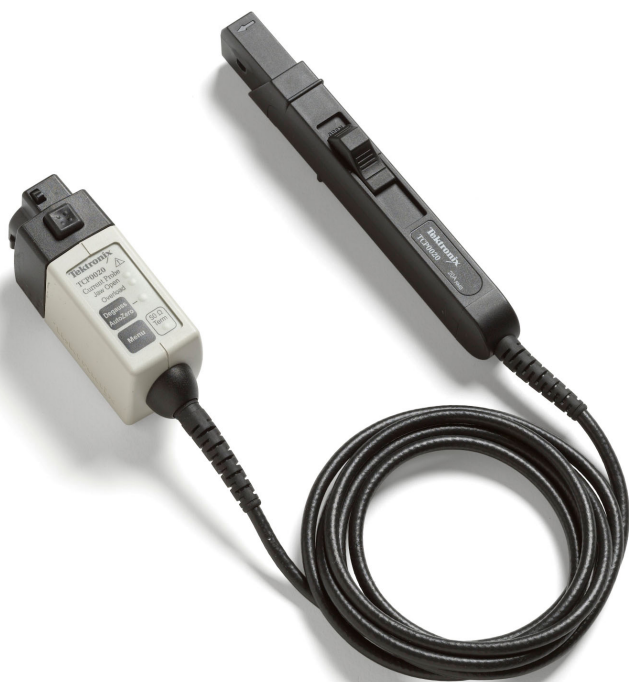
TCP0020 AC/DC Current Probe.