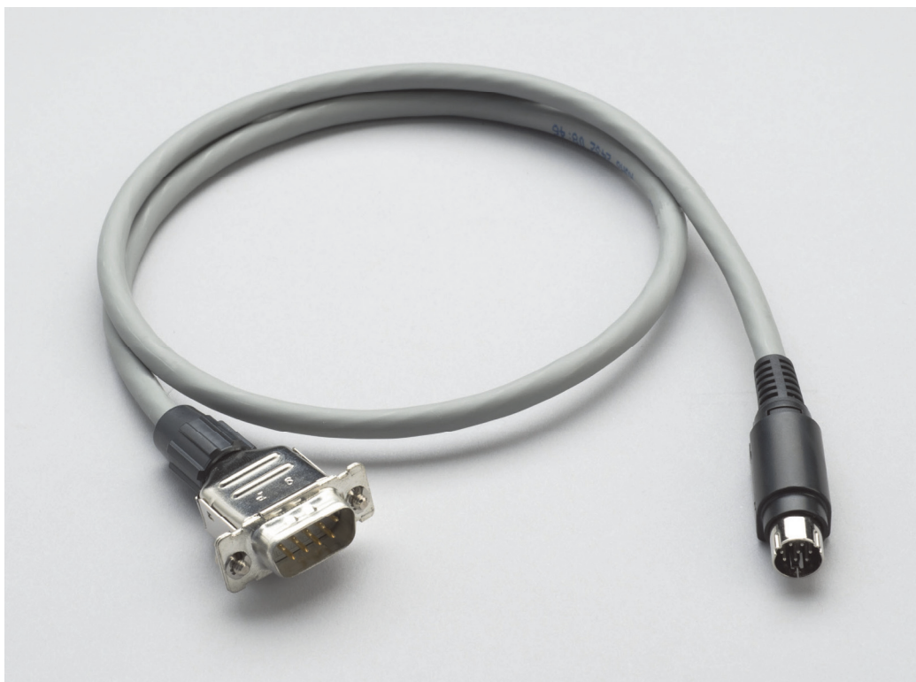
Figure 1: Model 2450-TLINK cable

Use the Model 2450-TLINK cable to connect the Model 2450 digital I/O port to an 8-pin micro DIN type trigger link connector (TLINK).