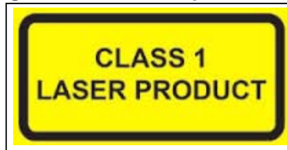
Figure 2. Class 1 laser product label

The VL6180X contains a laser emitter and corresponding drive circuitry. The laser output is designed to remain within Class 1 laser safety limits under all reasonably foreseeable conditions including single faults in compliance with IEC 60825-1:2007. The laser output will remain within Class 1 limits as long as the STMicroelectronics recommended device settings are used and the operating conditions specified in the datasheet are respected. The laser output power must not be increased by any means and no optics should be used with the intention of focusing the laser beam.