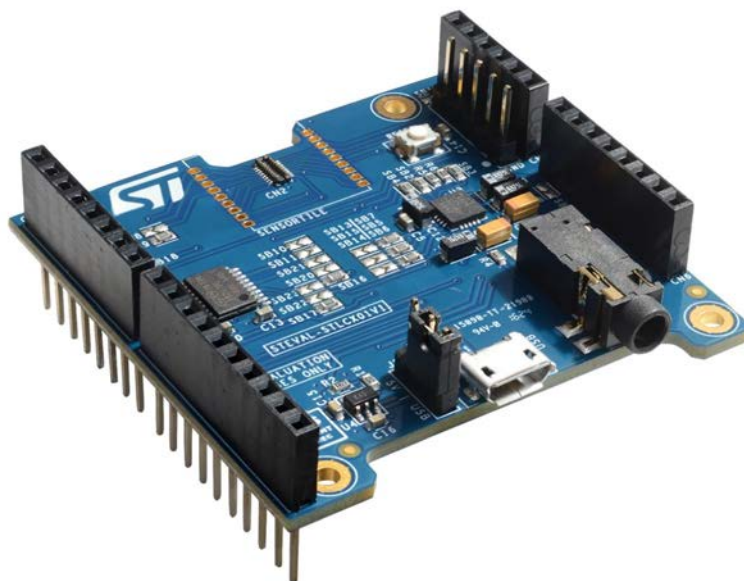
Figure 4. STLCX01V1 board photo