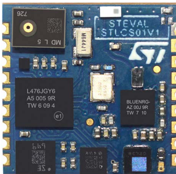
Figure 2. STLCS01V1 board photo