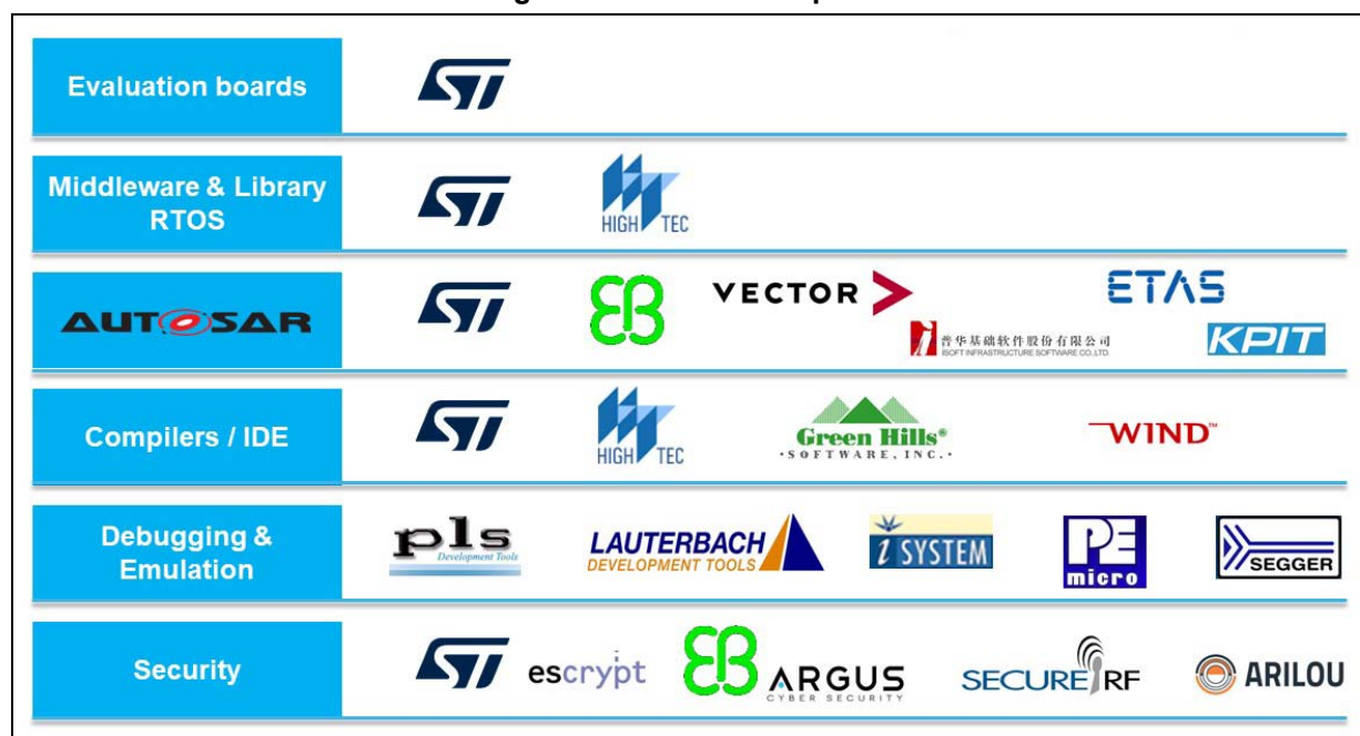
Figure 1. Software components and tools

Additional software components and tools are available by selected 3rd parties: