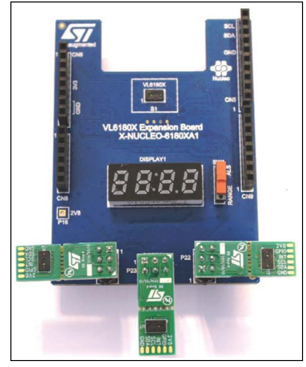
Figure 2. Connections of VL6180X satellite boards

Note: VL6180X satellite boards can be ordered under the reference: VL6180X-SATEL.