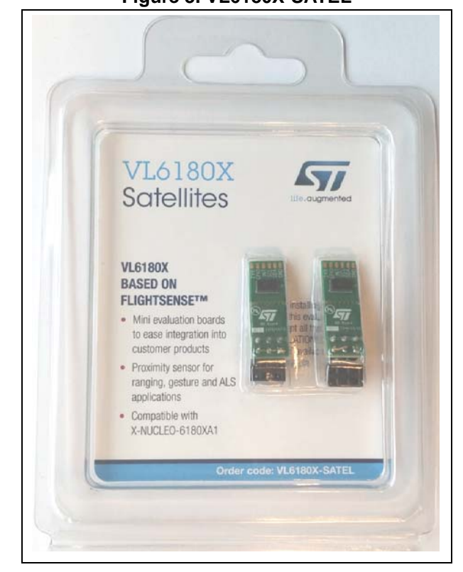
Figure 3. VL6180X-SATEL

Note: VL6180X satellite boards can be ordered under the reference: VL6180X-SATEL.