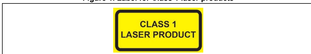
Figure 1. Label for Class 1 laser products

The VL53L0X contains a laser emitter and corresponding drive circuitry. The laser output is designed to remain within Class 1 laser safety limits under all reasonably foreseeable conditions including single faults, in compliance with IEC 60825-1:2014 (third edition). The laser output will remain within Class 1 limits as long as STMicroelectronics recommended device settings are used and the operating conditions, specified in the STM32L4 Series datasheets, are respected. The laser output power must not be increased by any means and no optics should be used with the intention of focusing the laser beam. Figure 1 shows the warning label for Class 1 laser products.