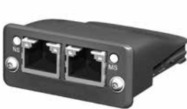
Active - (Industrial Ethernet)