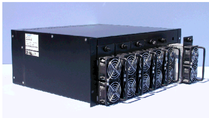
GPHP 600 shown in CRA rack

The GPHP Series are universal input AC/DC power supplies with power factor correction (PFC) with up to 700 Watts output power. The GPHP product incorporates 'hot-swap' capabilities and a handle. The series is approved to EN60950 to reduce design-in time and end system compliance costs