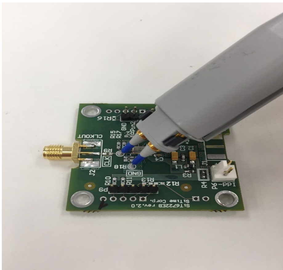
Figure 1: Proper Waveform capturing on SiT6722EB

Eliminating such distortion requires a probe with the lowest input capacitance and a low inductance ground lead. In addition, SiTime Super-TCXOs are typically configured for fast rise and fall times (1 ns or less) with 15 pF load. It is therefore critical that the probe tip ground be as short as possible, lowest inductance, and the return path for the ground be located as close as possible to the trace carrying the RF logic signal. Please refer to Figure A2 for test point locations on the SiT6722EB and an example of proper probing.