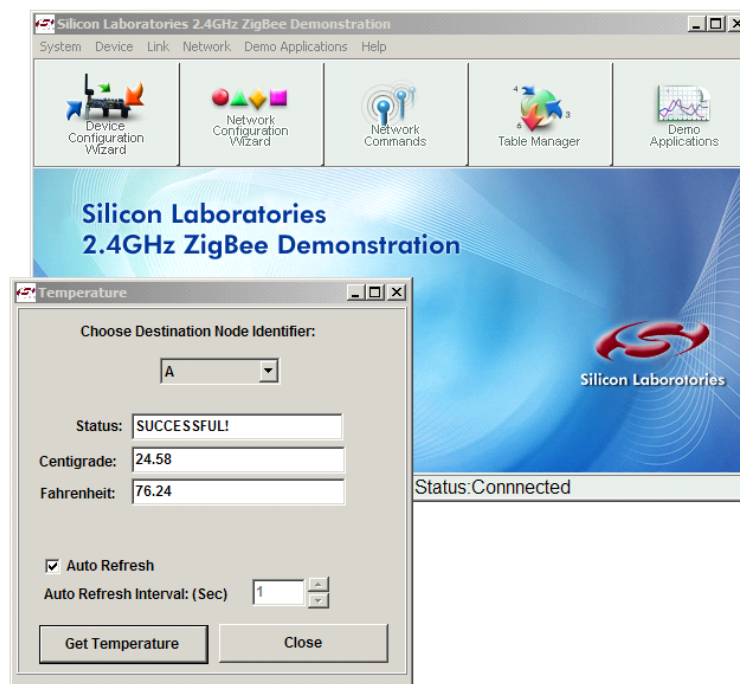
Figure 2. 2.4 GHz ZigBee Demonstration Software

Detailed instructions are in document "AN240: 2.4 GHz ZigBee Demonstration Software User's Guide", included with this kit.