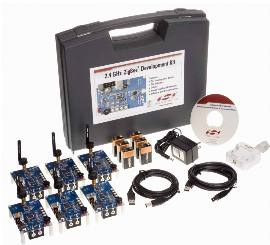
Figure 1. 2.4 GHz ZigBee Development Kit