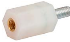
Transipillars Style 2