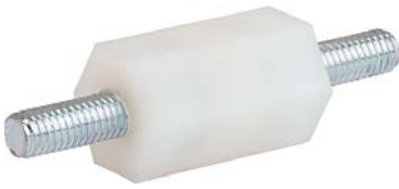
Transipillars Style 1

Transipillars, a rugged insulated mounting system