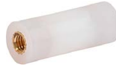
Transipillars Style 3