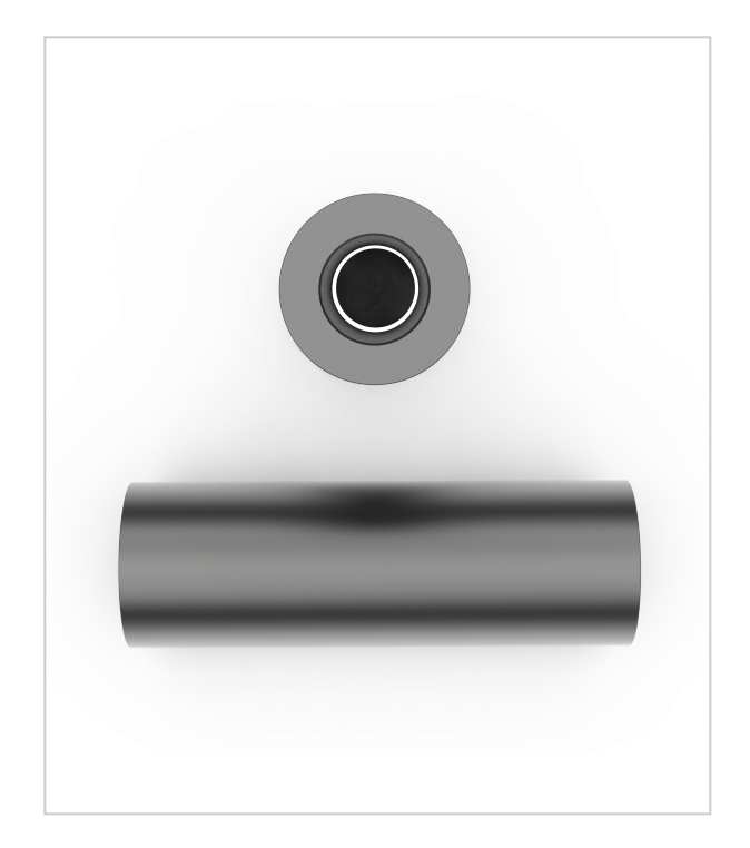
Home > 1132-2-S-12