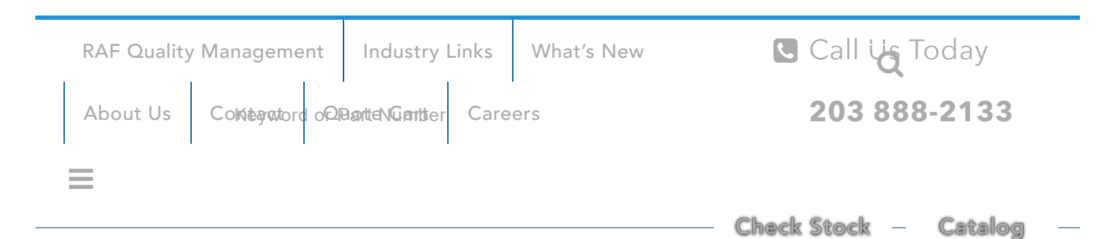
Home > 1124T-4-S-12