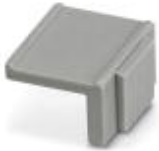
Equipment marker, width 12 mm