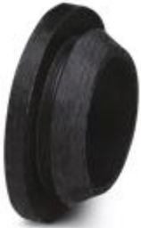
Cable bush for assembly troughs, for protection of the lines guided through the laminated frame

Please be informed that the data shown in this PDF Document is generated from our Online Catalog. Please find the complete data in the user's documentation. Our General Terms of Use for Downloads are valid ( http://phoenixcontact.com/download )