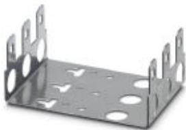
The illustration shows version CT 10-MB/ 3

Mounting clip, for holding 10 disconnect or ground wire strips. Version: 10 double conductors, dimensions: A 104.5 mm, dimensions B 245.5 mm