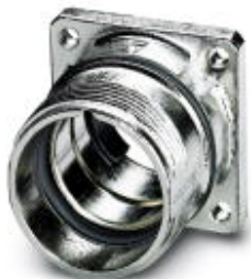
Panel mounting base, straight, Screw locking, M23, Axial O-ring, 4x Ø2,7, shielded: yes

Please be informed that the data shown in this PDF Document is generated from our Online Catalog. Please find the complete data in the user's documentation. Our General Terms of Use for Downloads are valid ( http://phoenixcontact.com/download )