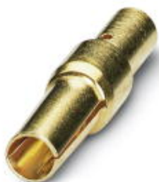
Crimp contact, turned, contact diameter: 2 mm, crimp range: 0.5 mm 2 ... 0.75 mm 2

Please be informed that the data shown in this PDF Document is generated from our Online Catalog. Please find the complete data in the user's documentation. Our General Terms of Use for Downloads are valid ( http://phoenixcontact.com/download )