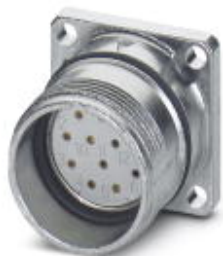
Device connector for front wall, straight, shielded: yes, Screw locking, M23, No. of pos.: 16, type of contact: Socket, Solder connection, Radial O-ring, 4x Ø 3.2

Please be informed that the data shown in this PDF Document is generated from our Online Catalog. Please find the complete data in the user's documentation. Our General Terms of Use for Downloads are valid ( http://phoenixcontact.com/download )