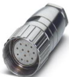
Cable connector, straight, shielded: no, Screw locking, M23

Please be informed that the data shown in this PDF Document is generated from our Online Catalog. Please find the complete data in the user's documentation. Our General Terms of Use for Downloads are valid ( http://phoenixcontact.com/download )