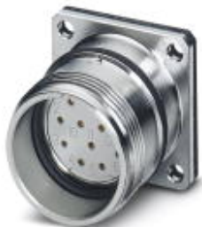
Device connector for front wall, straight, shielded: yes, Screw locking, M23, No. of pos.: 12, type of contact: Socket, Solder connection, Flat gasket, 4x Ø 3.2

Please be informed that the data shown in this PDF Document is generated from our Online Catalog. Please find the complete data in the user's documentation. Our General Terms of Use for Downloads are valid ( http://phoenixcontact.com/download )