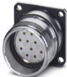
Device connector for rear wall, straight, Screw locking, M23, No. of pos.: 12, type of contact: Socket, Solder connection, Flat gasket, 4x M2.5

Please be informed that the data shown in this PDF Document is generated from our Online Catalog. Please find the complete data in the user's documentation. Our General Terms of Use for Downloads are valid ( http://phoenixcontact.com/download )