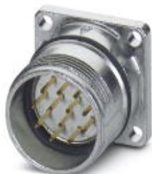
Device connector for front wall, straight, shielded: yes, Screw locking, M23, No. of pos.: 12, type of contact: Pin, Solder connection, Axial O-ring, 4x Ø 3.2

Please be informed that the data shown in this PDF Document is generated from our Online Catalog. Please find the complete data in the user's documentation. Our General Terms of Use for Downloads are valid ( http://phoenixcontact.com/download )