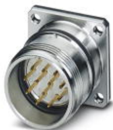
Device connector for front wall, straight, shielded: yes, Screw locking, M23, No. of pos.: 8+1, type of contact: Pin, Crimp connection, Flat gasket, 4x Ø 3.2

Please be informed that the data shown in this PDF Document is generated from our Online Catalog. Please find the complete data in the user's documentation. Our General Terms of Use for Downloads are valid ( http://phoenixcontact.com/download )