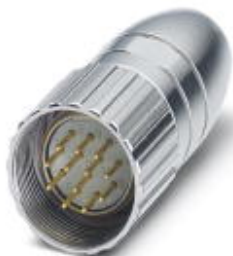
Cable connector, straight, shielded: yes, Screw locking, M23

Please be informed that the data shown in this PDF Document is generated from our Online Catalog. Please find the complete data in the user's documentation. Our General Terms of Use for Downloads are valid ( http://phoenixcontact.com/download )