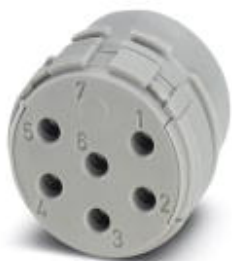
Contact insert, number of positions: 6, type of contact: Pin, Crimp connection

Please be informed that the data shown in this PDF Document is generated from our Online Catalog. Please find the complete data in the user's documentation. Our General Terms of Use for Downloads are valid ( http://phoenixcontact.com/download )