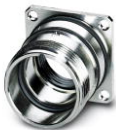
Panel mounting base, straight, Screw locking, M23, Radial O-ring, 4x Ø2,7, shielded: yes, panel thickness min.: 2.7 mm, panel thickness max.: 3.5 mm

Please be informed that the data shown in this PDF Document is generated from our Online Catalog. Please find the complete data in the user's documentation. Our General Terms of Use for Downloads are valid ( http://phoenixcontact.com/download )