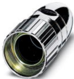
Sleeve housing for cable connector, straight, Screw locking, M23, shielded: no

Please be informed that the data shown in this PDF Document is generated from our Online Catalog. Please find the complete data in the user's documentation. Our General Terms of Use for Downloads are valid ( http://phoenixcontact.com/download )