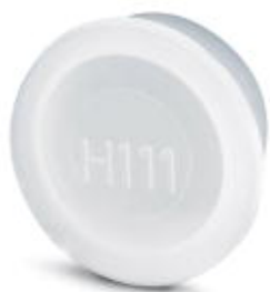
Plastic dust protection cap for connectors with M27 knurled nuts

Please be informed that the data shown in this PDF Document is generated from our Online Catalog. Please find the complete data in the user's documentation. Our General Terms of Use for Downloads are valid ( http://phoenixcontact.com/download )