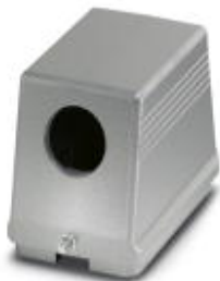
HEAVYCON sleeve housing B48, for single locking latch, height 96 mm, with thread 1x M50, lateral conductor exit

Please be informed that the data shown in this PDF Document is generated from our Online Catalog. Please find the complete data in the user's documentation. Our General Terms of Use for Downloads are valid ( http://phoenixcontact.com/download )