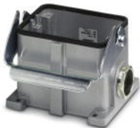
Box mounting base, with single locking latch, with protective cover, height: 100 mm, without screw connection, 2 x Pg36

Please be informed that the data shown in this PDF Document is generated from our Online Catalog. Please find the complete data in the user's documentation. Our General Terms of Use for Downloads are valid ( http://phoenixcontact.com/download )