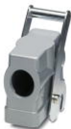
HEAVYCON sleeve housing B24, with main latch, height 76 mm, with 1 x M32 thread , lateral conductor outlet

Please be informed that the data shown in this PDF Document is generated from our Online Catalog. Please find the complete data in the user's documentation. Our General Terms of Use for Downloads are valid ( http://phoenixcontact.com/download )