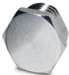
M16 screw plug for unused M12 housing cutouts

Please be informed that the data shown in this PDF Document is generated from our Online Catalog. Please find the complete data in the user's documentation. Our General Terms of Use for Downloads are valid ( http://phoenixcontact.com/download )