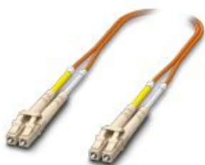
Multi-mode OM2 duplex jumper, LC-LC, UPC polishing, length 2 m

Please be informed that the data shown in this PDF Document is generated from our Online Catalog. Please find the complete data in the user's documentation. Our General Terms of Use for Downloads are valid ( http://phoenixcontact.com/download )