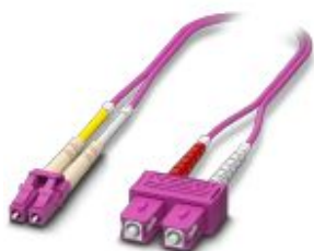
Multi-mode OM4 duplex jumper, LC-SC, UPC polishing, length 2 m

Please be informed that the data shown in this PDF Document is generated from our Online Catalog. Please find the complete data in the user's documentation. Our General Terms of Use for Downloads are valid ( http://phoenixcontact.com/download )