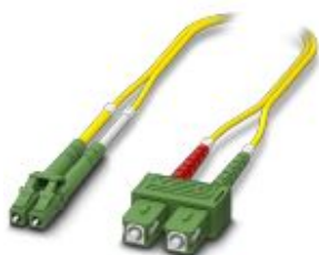
Single-mode OS2 duplex jumper, LC-SC, APC polishing, length 0.5 m

Please be informed that the data shown in this PDF Document is generated from our Online Catalog. Please find the complete data in the user's documentation. Our General Terms of Use for Downloads are valid ( http://phoenixcontact.com/download )