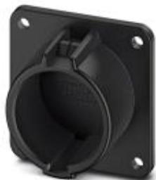
Retainer for Vehicle Connector as parking position at charging stations (EVSE), Type 1, SAE J1772, Front mounting

Please be informed that the data shown in this PDF Document is generated from our Online Catalog. Please find the complete data in the user's documentation. Our General Terms of Use for Downloads are valid ( http://phoenixcontact.com/download )