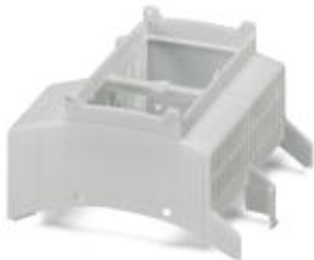
Upper part, Color: gray, Width: 71.6 mm

Please be informed that the data shown in this PDF Document is generated from our Online Catalog. Please find the complete data in the user's documentation. Our General Terms of Use for Downloads are valid ( http://phoenixcontact.com/download )