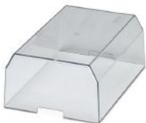
Cover, for the contact- and dust-protected encapsulation of the components

Please be informed that the data shown in this PDF Document is generated from our Online Catalog. Please find the complete data in the user's documentation. Our General Terms of Use for Downloads are valid ( http://phoenixcontact.com/download )