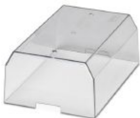
Cover, for the contact- and dust-protected encapsulation of the components

Please be informed that the data shown in this PDF Document is generated from our Online Catalog. Please find the complete data in the user's documentation. Our General Terms of Use for Downloads are valid ( http://phoenixcontact.com/download )