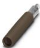
Female test connector, color: brown

Female test connector - PSBJ-URTK 6 BN - 3026971