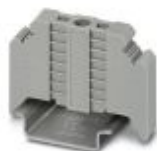
End clamp, width: 9.5 mm, color: gray