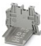
Quick mounting end clamp for NS 35/7,5 DIN rail or NS 35/15 DIN rail, with marking option, with parking option for FBS...5, FBS...6, KSS 5, KSS 6, width: 5.15 mm, color: gray