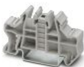
Quick mounting end clamp for NS 35/7,5 DIN rail or NS 35/15 DIN rail, with marking option, width: 9.5 mm, color: gray