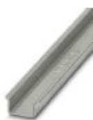
DIN rail, unperforated, Standard profile 2.3 mm, width: 35 mm, height: 15 mm, acc. to EN 60715, material: Steel, galvanized, passivated with a thick layer, length: 2000 mm, color: silver

DIN rail, unperforated - NS 35/15-2,3 UNPERF 2000MM - 1201798