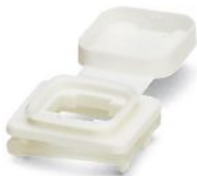
IP54 protection with color marking for SFN switch and angled patch connector, white

Please be informed that the data shown in this PDF Document is generated from our Online Catalog. Please find the complete data in the user's documentation. Our General Terms of Use for Downloads are valid ( http://phoenixcontact.com/download )