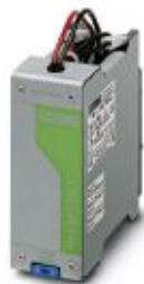
Energy storage device, lead AGM, VRLA technology, 12 V DC, 2.6 Ah.

Please be informed that the data shown in this PDF Document is generated from our Online Catalog. Please find the complete data in the user's documentation. Our General Terms of Use for Downloads are valid ( http://phoenixcontact.com/download )