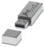
USB memory stick, 8 GB

USB memory stick - USB FLASH DRIVE - 2402809