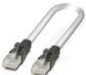
Patch cable, CAT5, assembled, 2 m

Patch cable - FL CAT5 PATCH 2,0 - 2832289