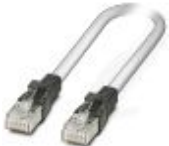
Patch cable, CAT5, assembled, 0.5 m

Patch cable - FL CAT5 PATCH 0,5 - 2832263