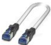
Patch cable, CAT6, pre-assembled, 2.0 m

Patch cable - FL CAT6 PATCH 2,0 - 2891589