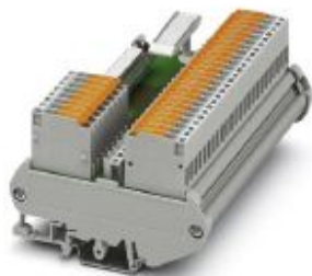
VARIOFACE module for ABB S800 I/O, with knife disconnect terminal blocks and specific marking (A1, B1, C1, A2, B2, C2, ... A8, B8, C8)

Please be informed that the data shown in this PDF Document is generated from our Online Catalog. Please find the complete data in the user's documentation. Our General Terms of Use for Downloads are valid ( http://phoenixcontact.com/download )